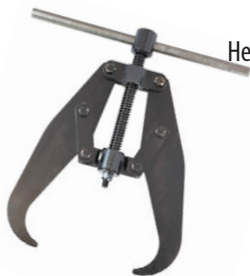
Heavy Duty Screw Actuated Tightener (2506HD)